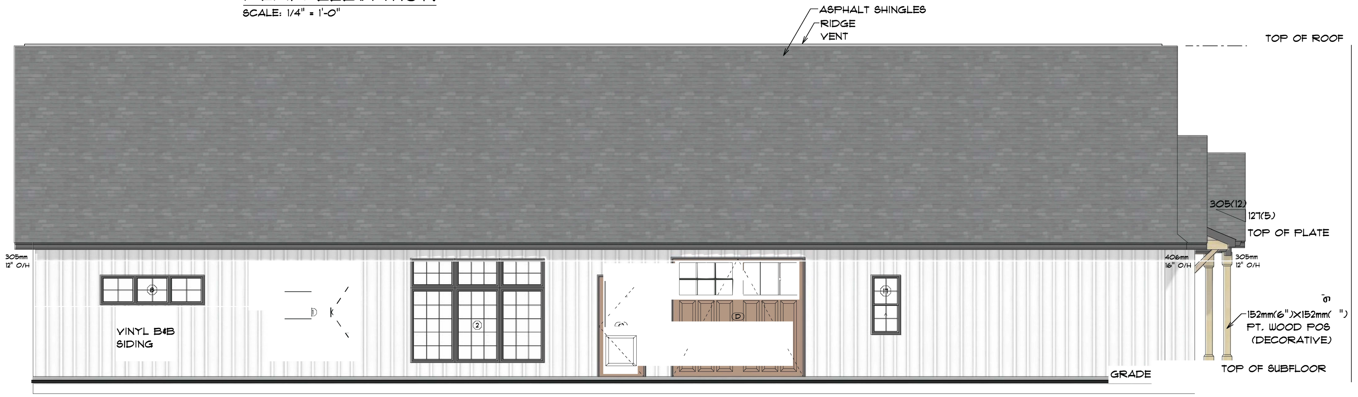
LEFT ELEVATION SCALE: 1/4" = 1'-0"